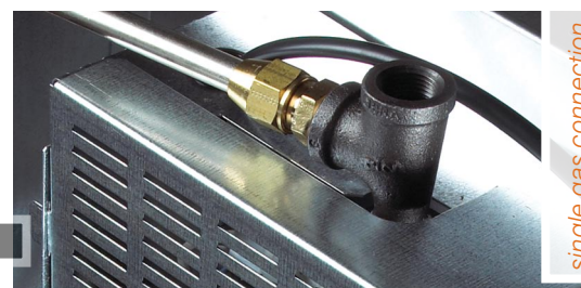
single gas connection